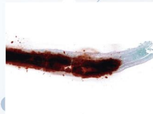
GDA Fixed Pericardium Mitral valve implant – 6 months