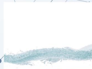
dCell Pericardium Mitral valve implant – 6 months

Movat pre and pos – DNA control and post – Rat Study – Stress-Strain – Curves